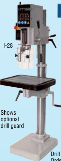
Shows optional drill guard

Drill Guard Order# IMA-TB2552 LIST PRICE: $560.00