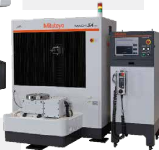
MACH-3A 653 Item No. 360-412

List Price $187,838.00 USD STARTING AT $160,000 USD