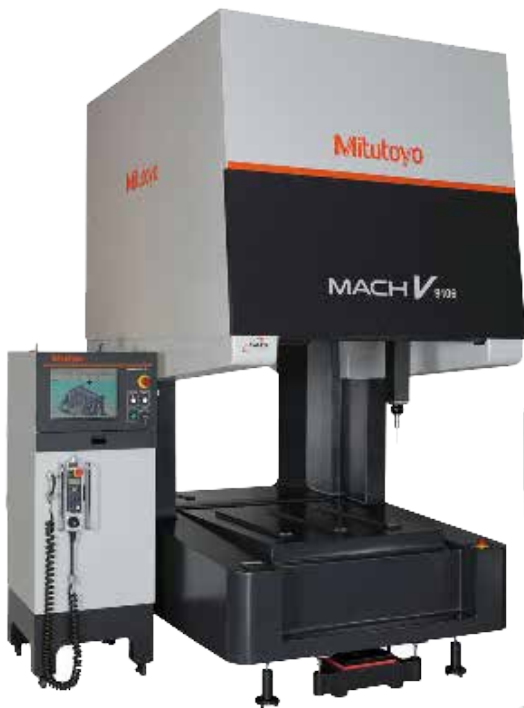
MACH-V9106 Item No.360-224-10

List Price $187,838.00 USD STARTING AT $160,000 USD