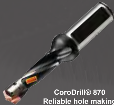
CoroDrill® 870 Reliable hole making 3-10 x DC drilling