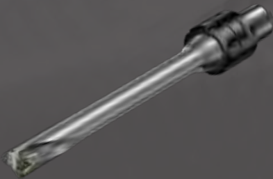
CoroDrill® DS20 First choice for general 4-7 x DC drilling

Up To 50% Off LIMITED TIME. RULES APPLY.