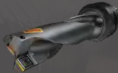
CoroDrill® 880 First choice for general 2-3 x DC drilling