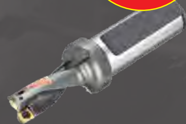
CoroDrill® 881 Problem solver in lathes 2-3 x DC drilling