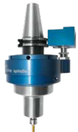
650CAT40 with Optional TMA

Fully automated loading with (1) optional TMA; or (2) through spindle air option using Haas Through Air Blast option. Manual connection also possible.