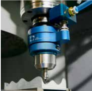
625CAT40 with Optional TMA

With Patented governed high speed and torque Air Turbine Spindles®, your Haas Machine is a high speed machine!