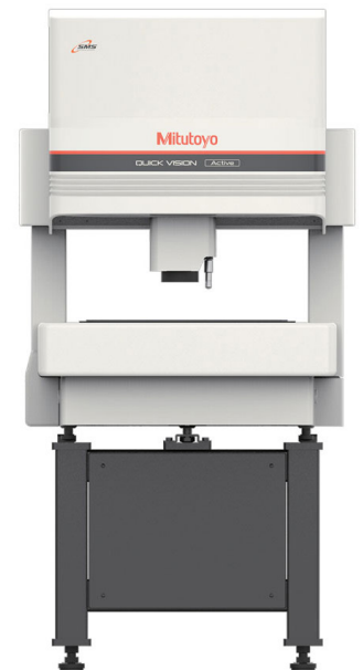
QUICK VISION Active 404